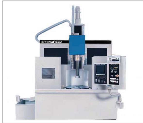
Machine with Standard Guarding

Actual machine W-H-L and Weight depend on ordered configuration. Technical data is subject to change without notice and may vary according to the workpiece geometry and options supplied. Workholding equipment supplied.